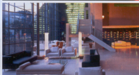
The Hotel Unique, Sao Paulo, Brazil. Designed by Ruy Ohtake. For information on this and many others, visit www.kiwicollection.com .